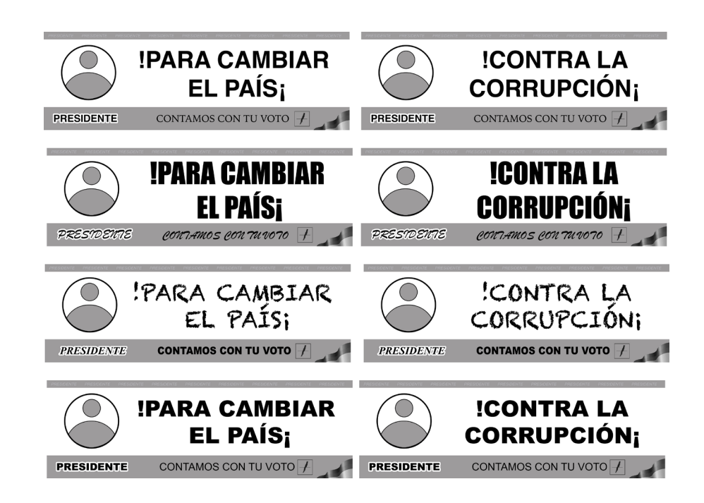
Figure 2. Design of graphic pieces with common characteristics identified in the study corpus.

For the qualitative analysis, the controlled experimental method was applied, designed from the generation of study groups, as representative samples, in the three provinces with the highest concentration of voting: Pichincha, Guayas and Manabí, which represent almost 50% of voters at the national level. Each group of eight people was defined by stratified random sampling, which was then chosen according to relevant selection criteria argued according to the theoretical bases of the research. Arias (2012) suggests that this input should be considered for up to 12 people to maintain control, effectiveness in data collection, and efficiency in the process, data collection, and interpretation. In each province, control groups were set up jointly under the same guidelines as the other groups.